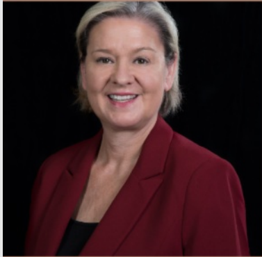
Gretchen Fagan TEDC, PRESIDENT MAYOR, CITY OF TOMBALL